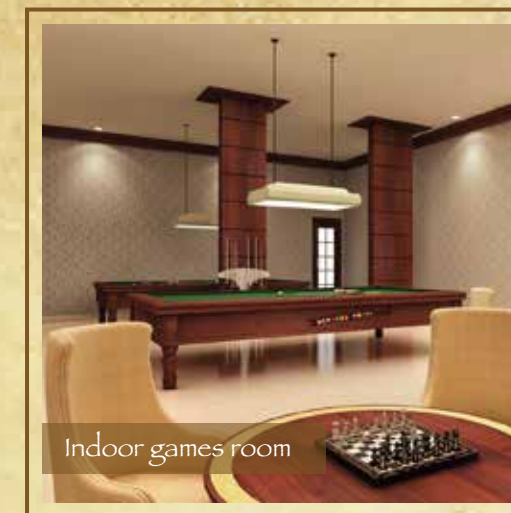
Indoor games room